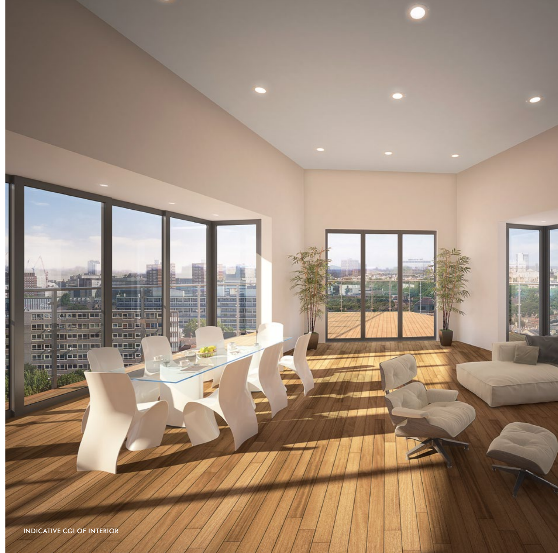
INDICATIVE CGI OF INTERIOR

Completed in 2005, the iconic South Central building was designed by multi-award winning architect Piers Gough of architectural practice CZWG. The stunning tiered elevation, rising to 10 storeys, has a sleek glass and aquamarine façade with angled balconies.